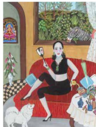
Sofas are so Comfortable • 2014