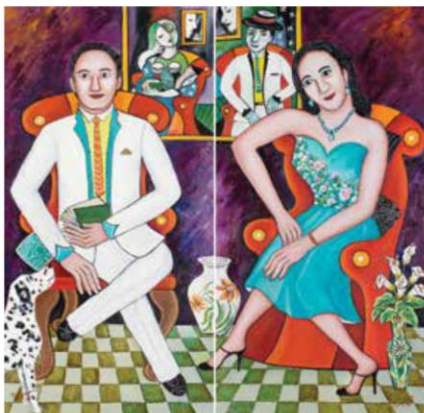
Two is Company diptych • 2017