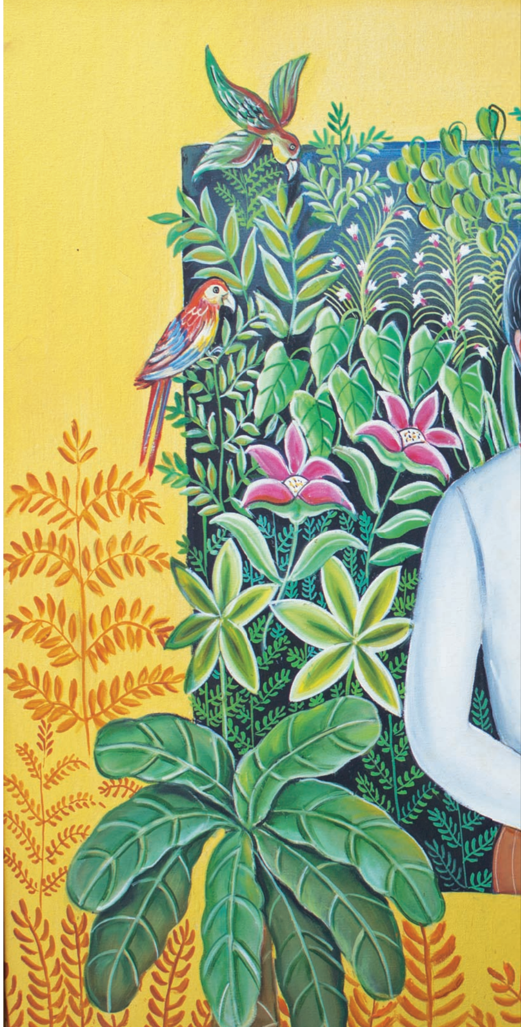
Positivity Oil on Canvas 30" x 40" | 2020