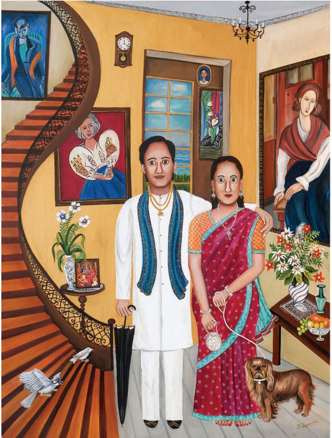
Female Power | Oil on Canvas | 48" x 36" | 2018