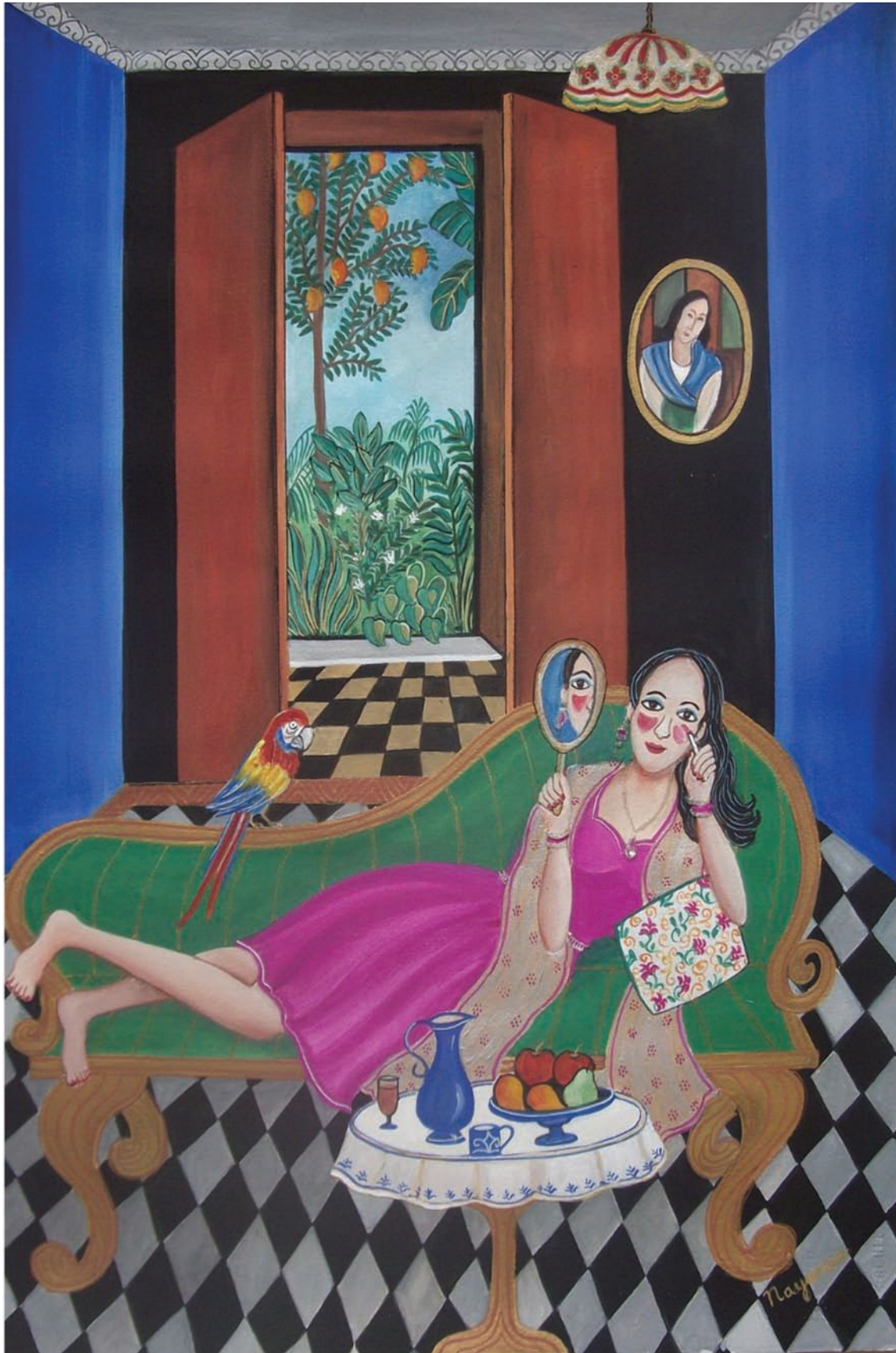
Where Should I Go Today | Mixed Media on Paper | 22" x 15" | 2019