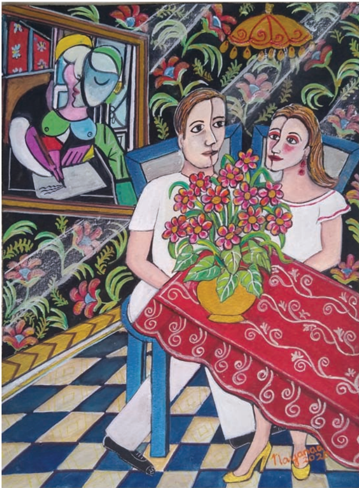
The Picasso Painting Mixed Media on Paper 15" x 11" | 2021