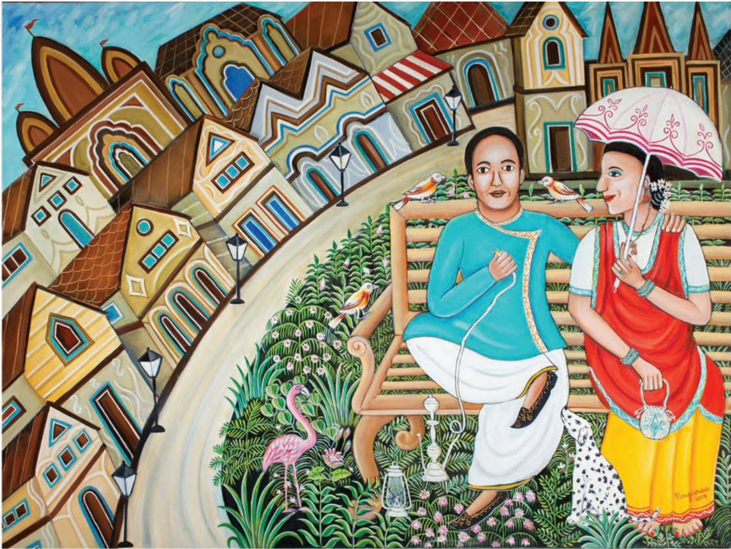
The Perfect Companionship | Oil on Canvas | 36" x 48" | 2019