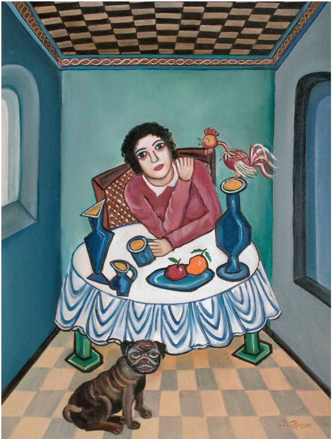
Reverie | Oil on Canvas | 24" x 18" | 2010