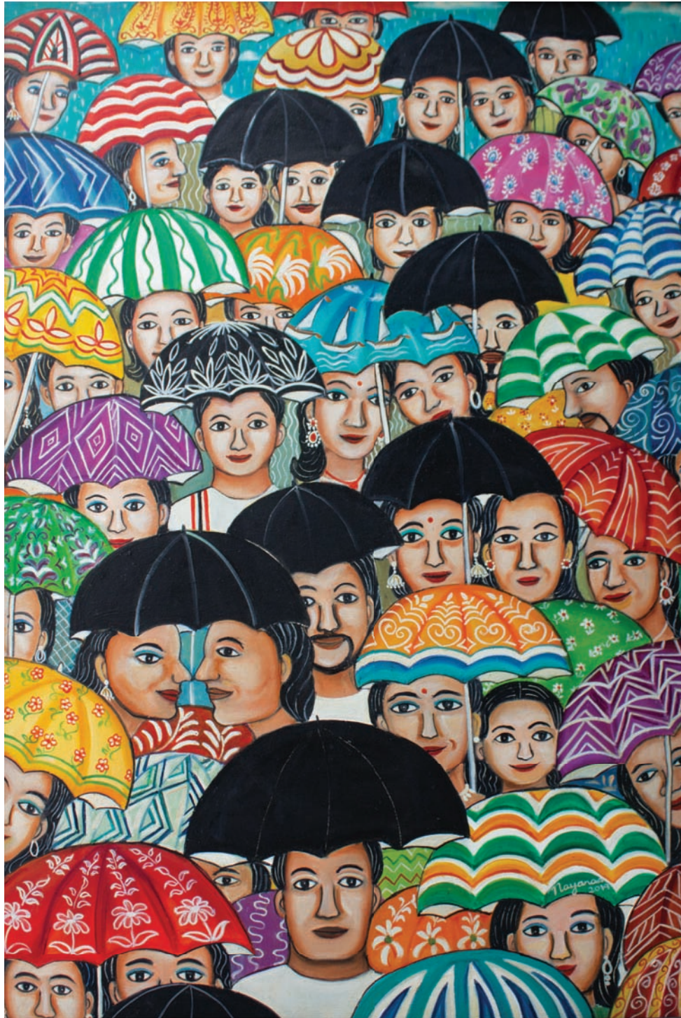
The Mumbai Monsoons | Oil on Canvas | 36" x 24" | 2019