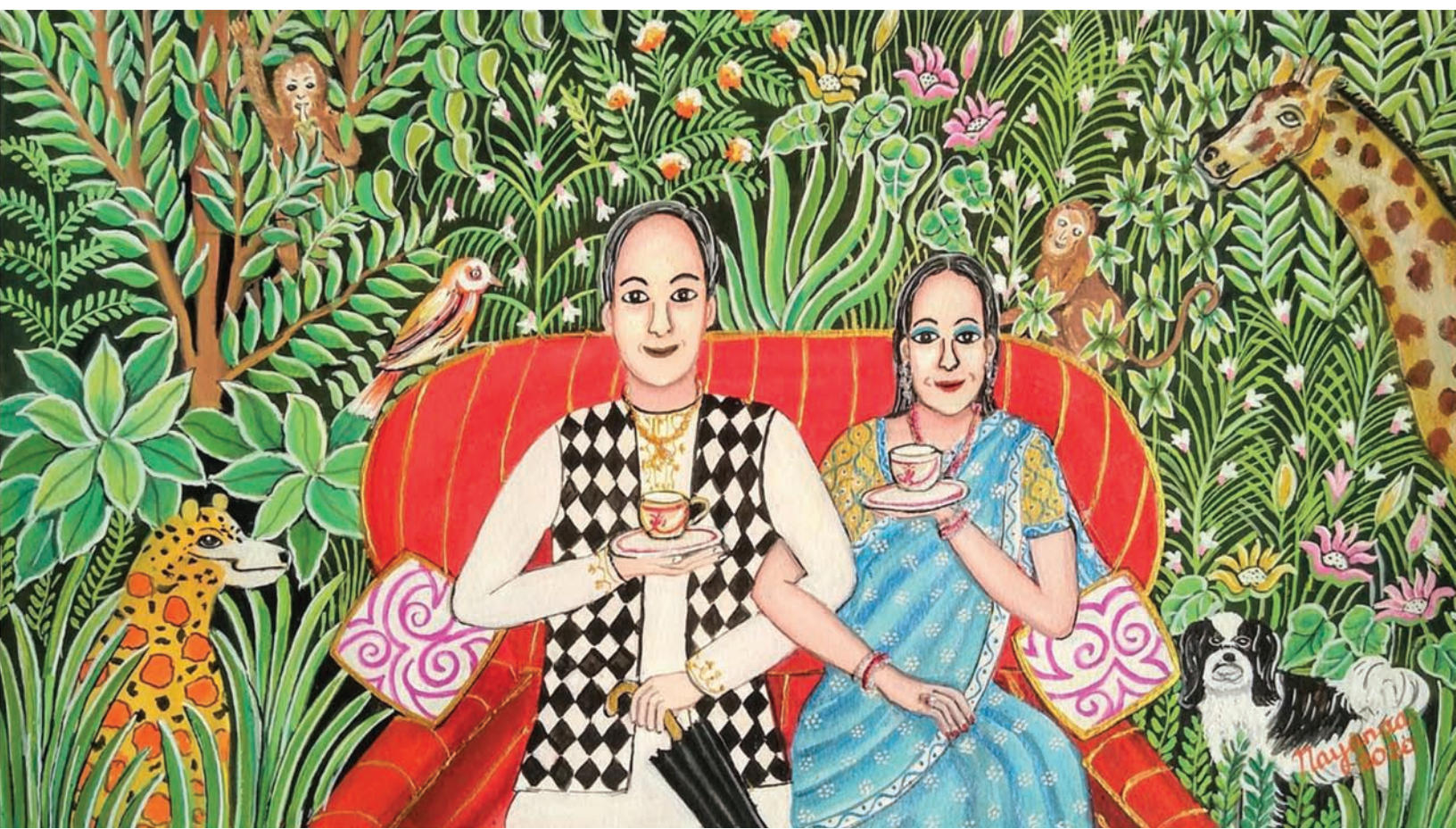
The Advent of the Monsoons | Mixed Media on Paper | 9.75" x 17.75" | 2020