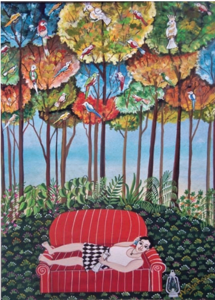
Jungle Siesta Mixed Media on Paper 15" x 11" | 2017