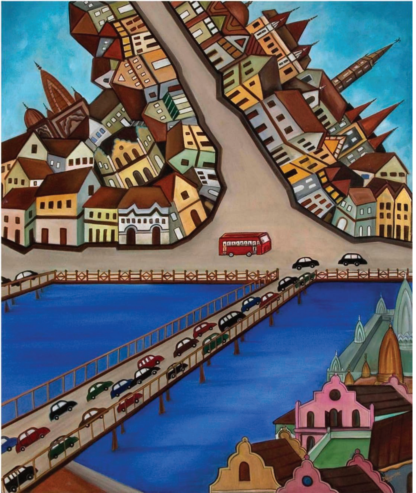
Easing Congestion | Oil on Canvas | 42" x 36" | 2010