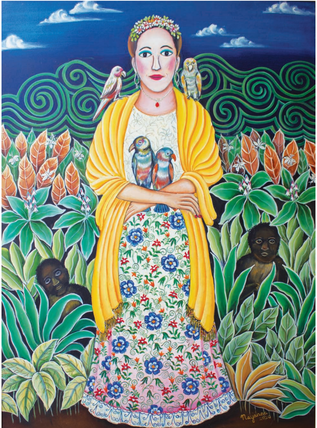
Seneorita | Oil on Canvas | 48" x 36" | 2021