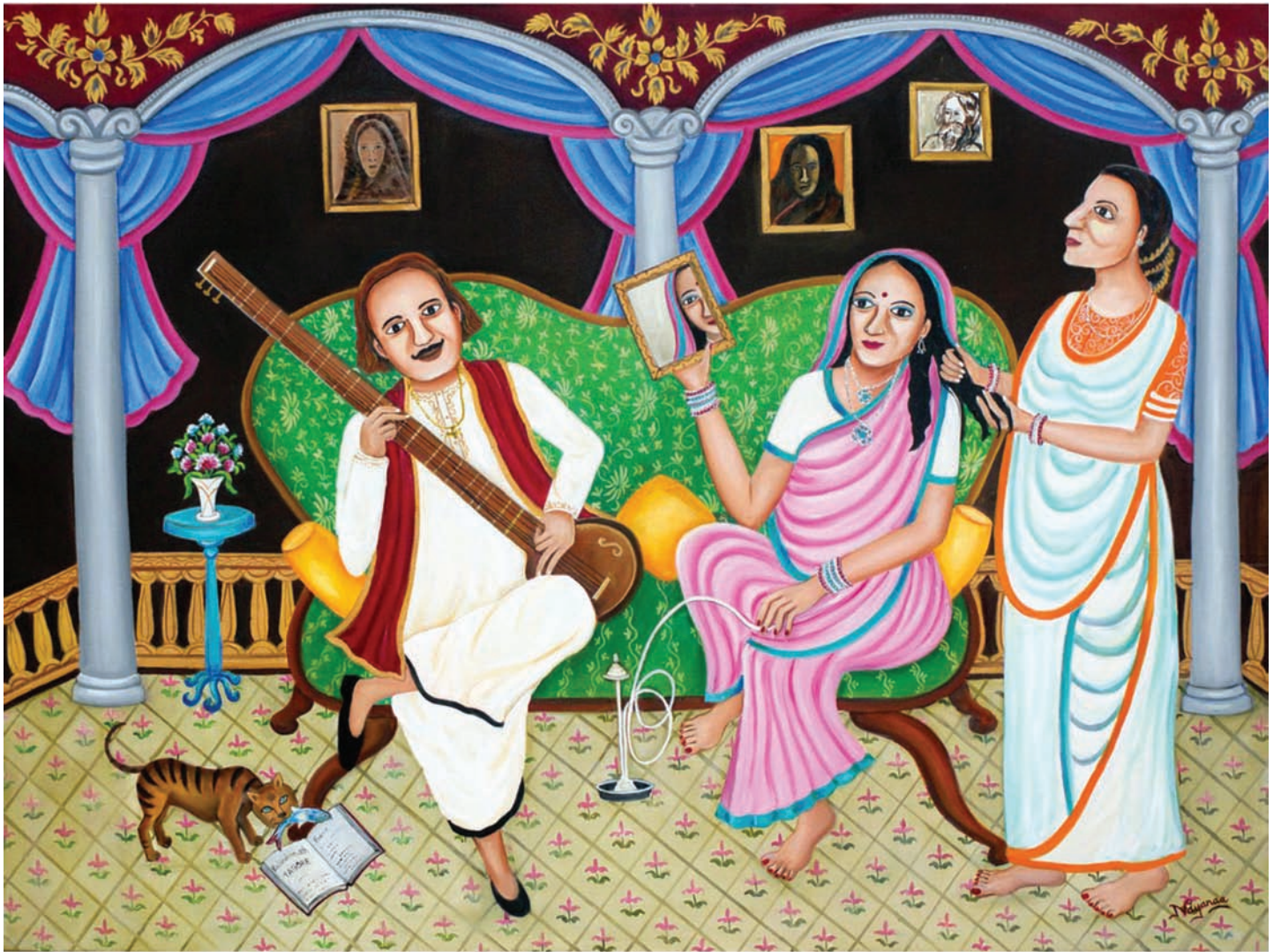
The Legacy Lives On | Oil on Canvas | 36" x 48" | 2016