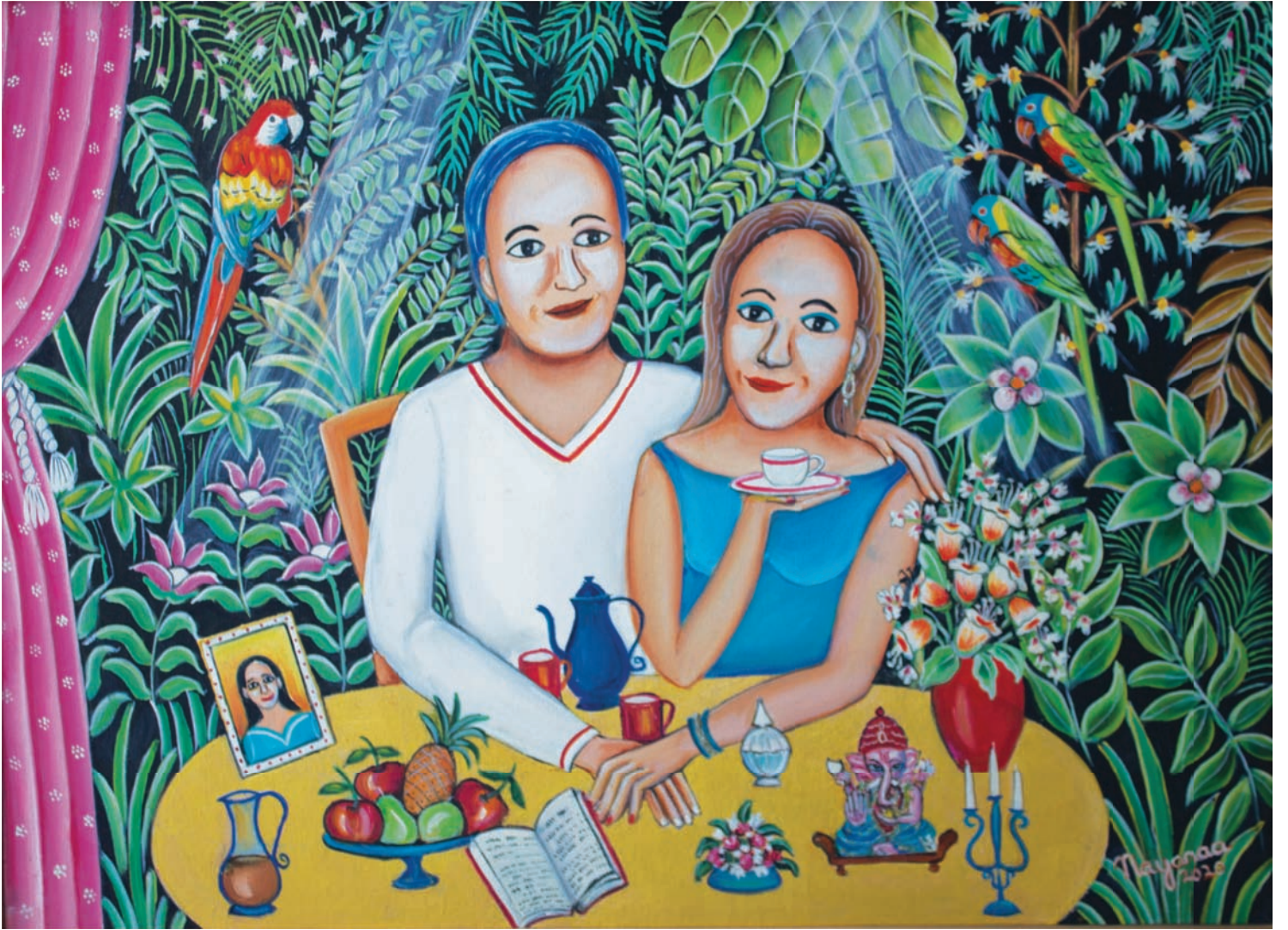
Away with Our Blues | Oil on Canvas | 21" x 30" | 2020