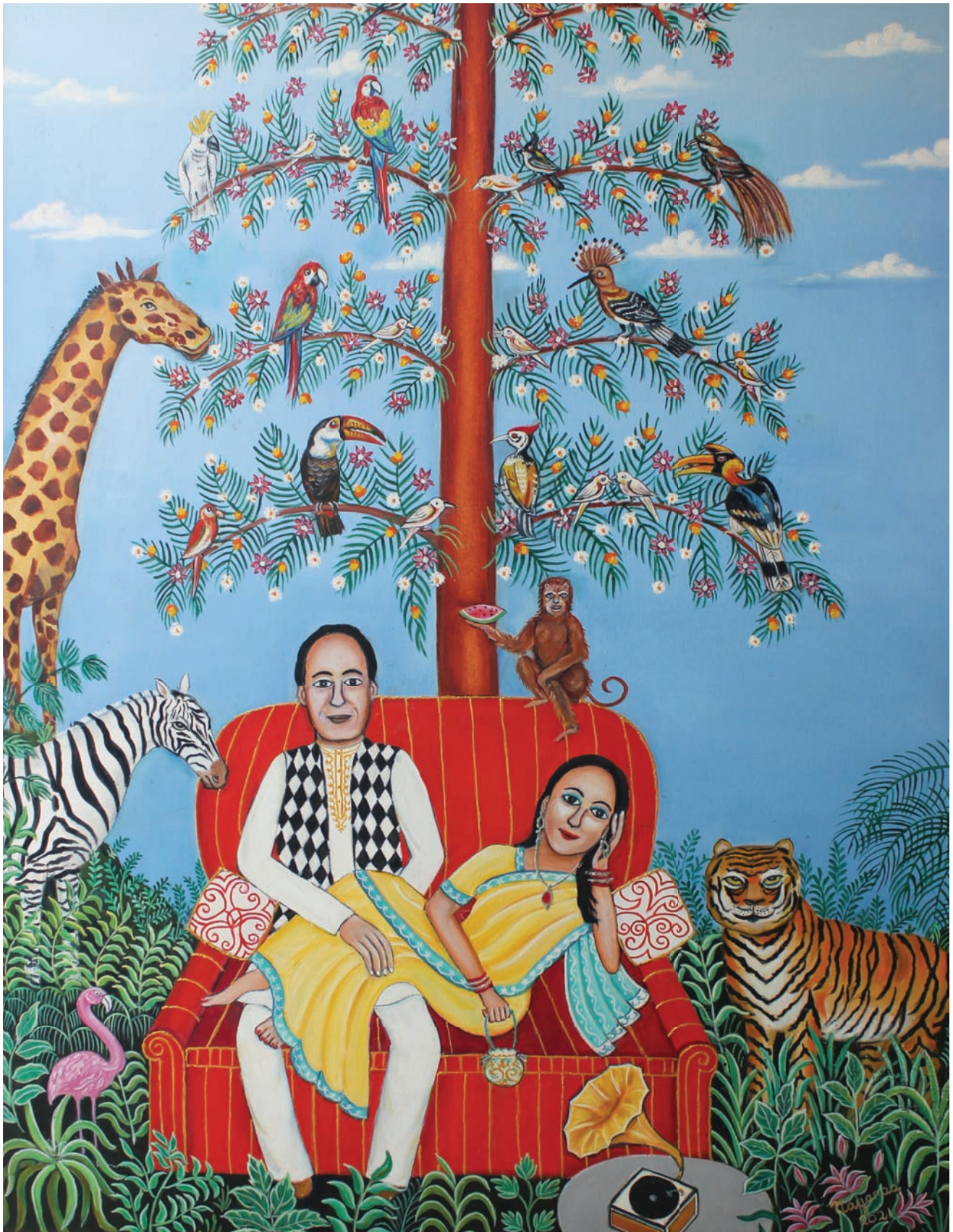
Our Tree Of Life | Oil on Canvas | 48" x 36" | 2021