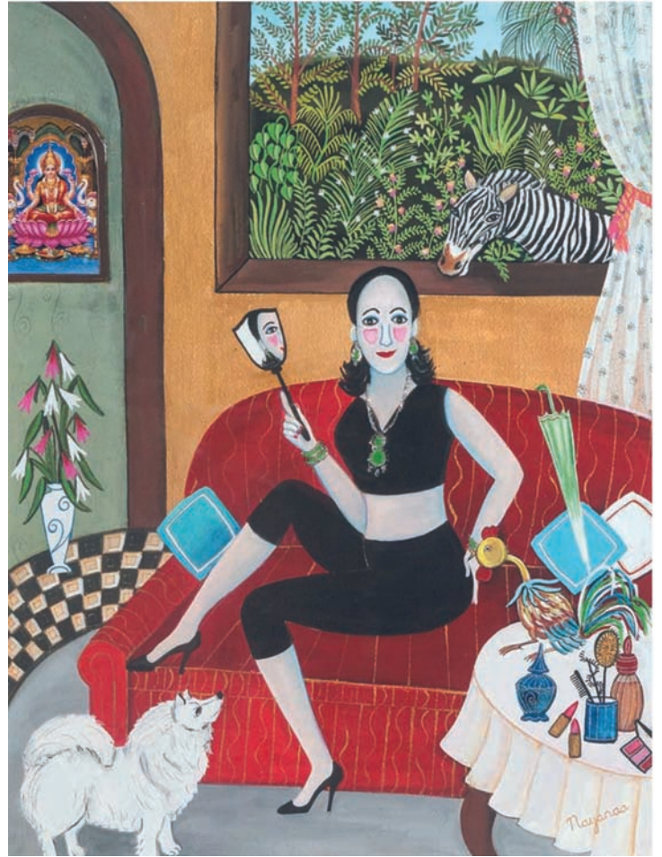
Sofas are so Comfortable Mixed Media on Paper 20" x 15" | 2019