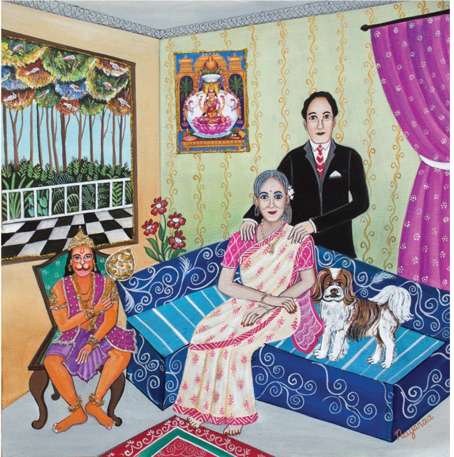
Lord Hanuman comes Visiting | Mixed Media on Paper | 15" x 15" | 2018