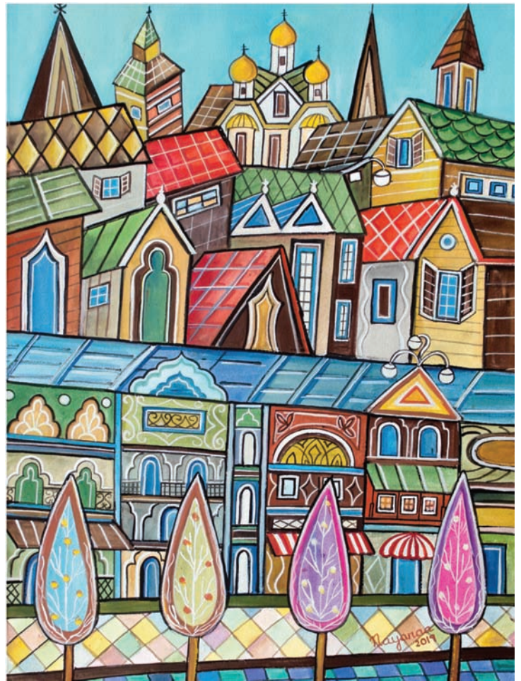
My City (1) Mixed Media on Paper 15" x 11" | 2019