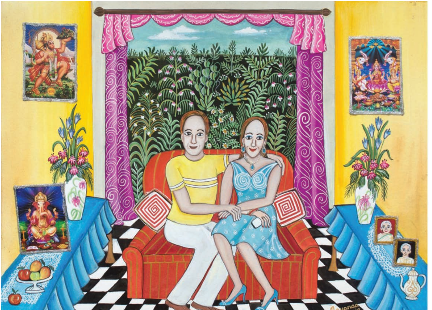
Our Space | Mixed Media on Paper | 15" x 20" | 2018