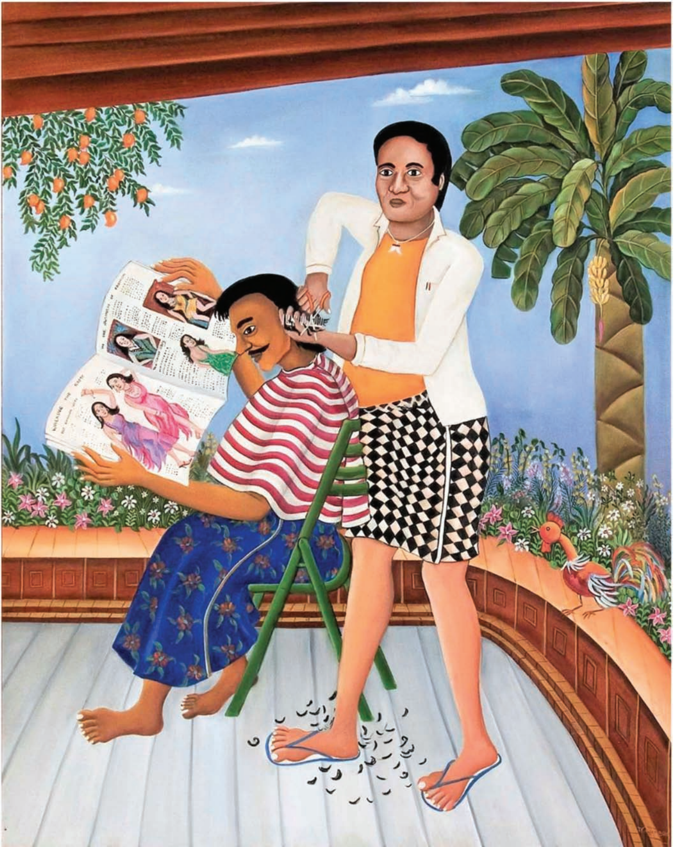
The Barber | Oil on Canvas | 60" x 48" | 2017