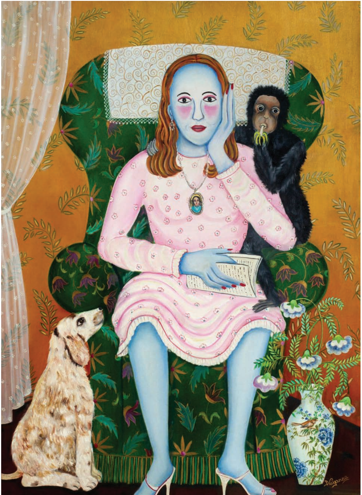
Pleasure | Oil on Canvas | 48" x 36" | 2018