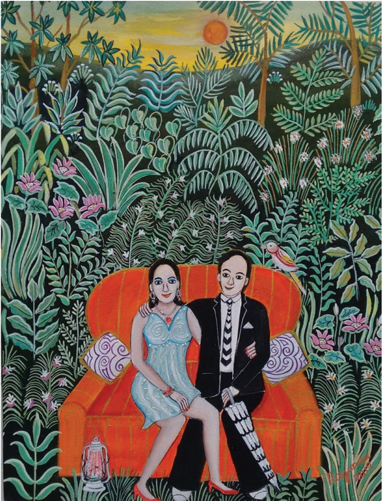
Our Day Out | Mixed Media on Paper | 14.50" x 11.25" | 2021