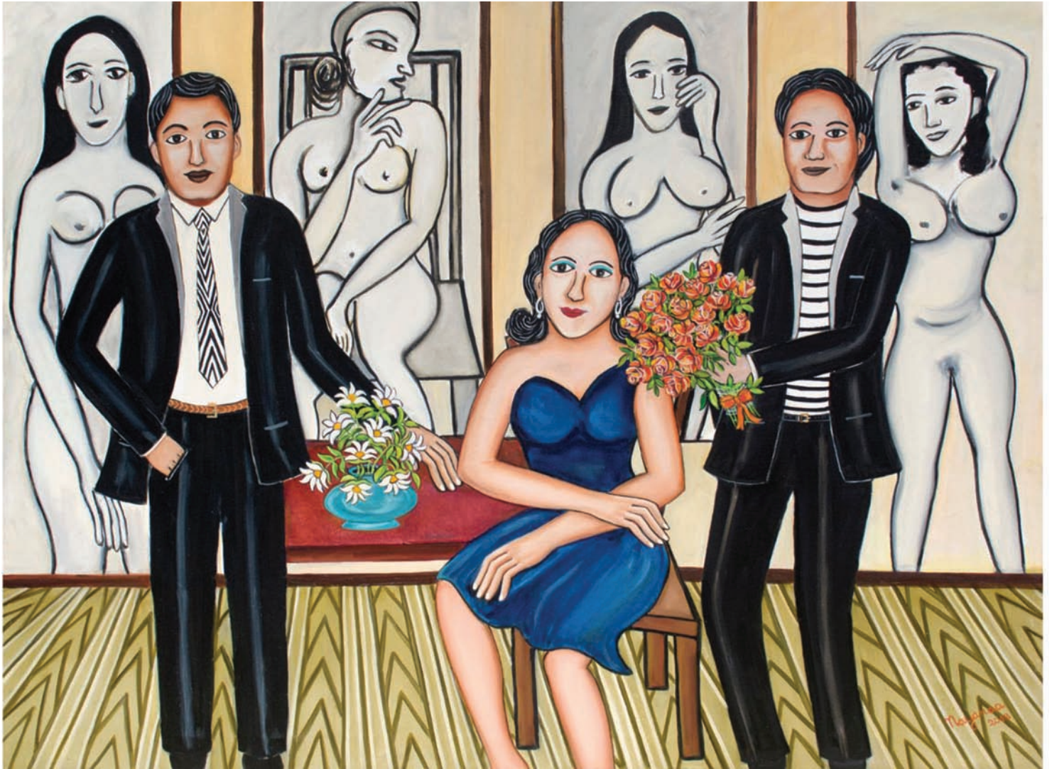
The Bouquet | Oil on Canvas | 36" x 48" | 2018