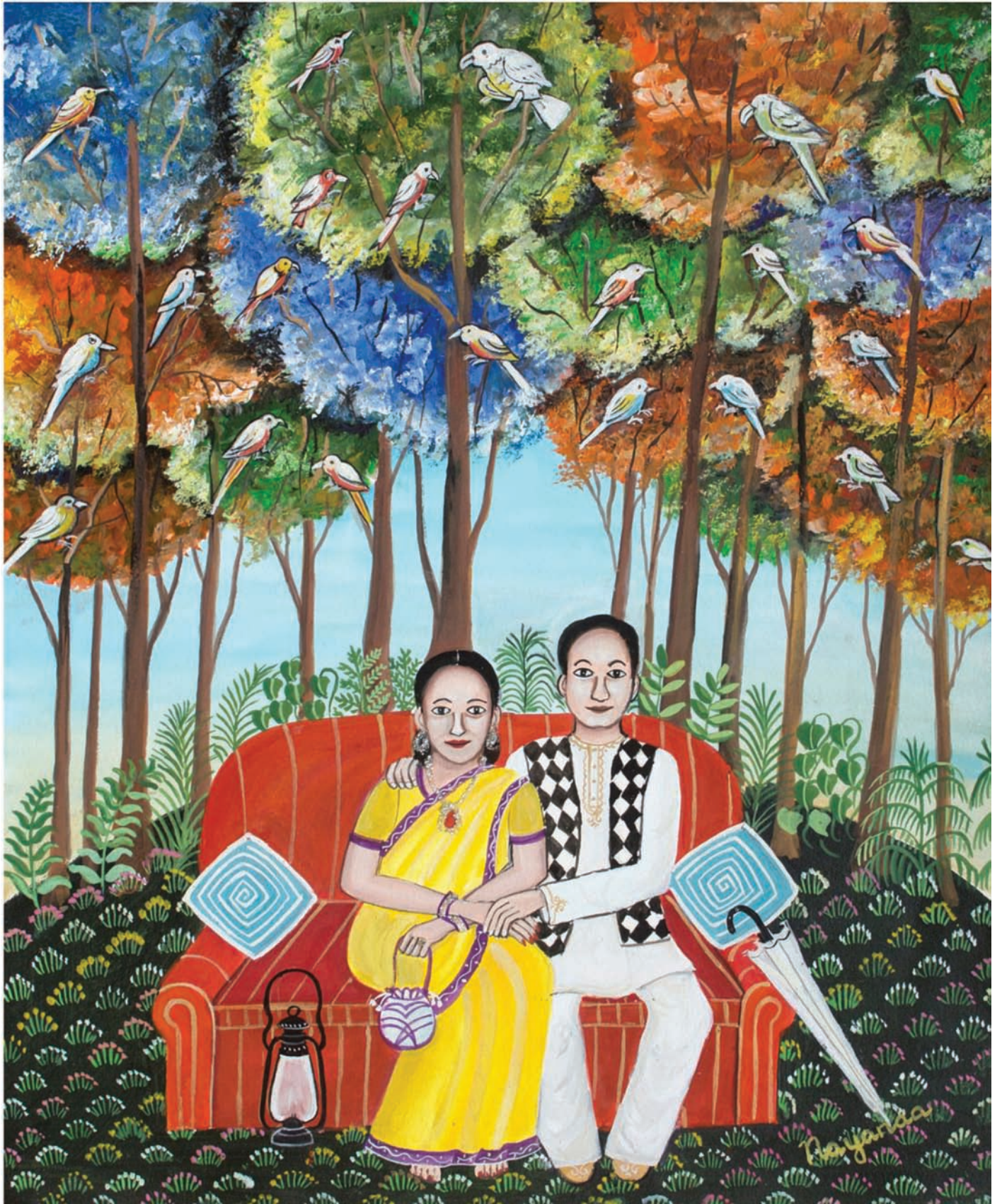
Quality Time | Mixed Media on Paper | 16" x 13" | 2019