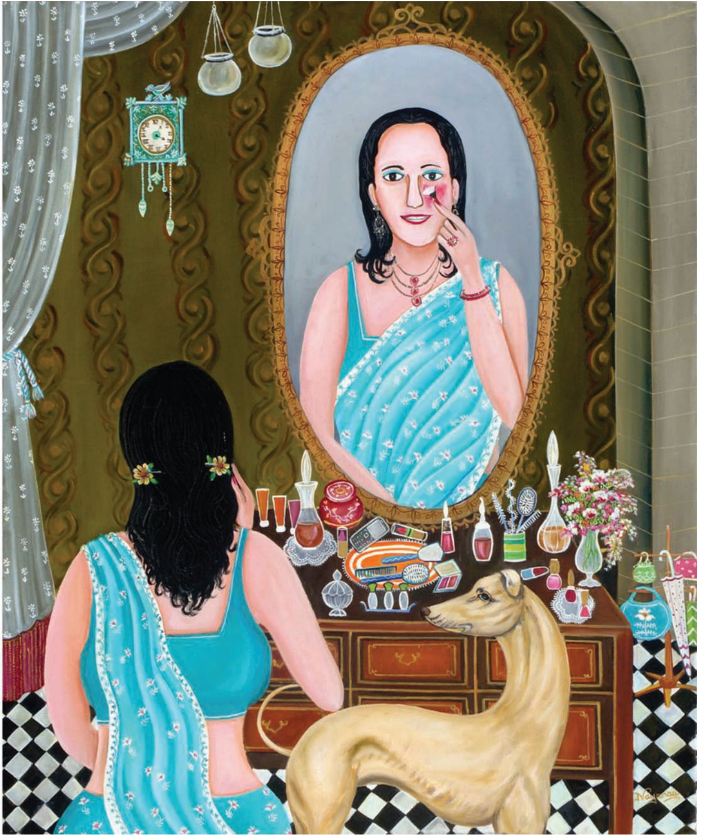
Beauty at its Best | Oil on Canvas | 42" x 36" | 2018