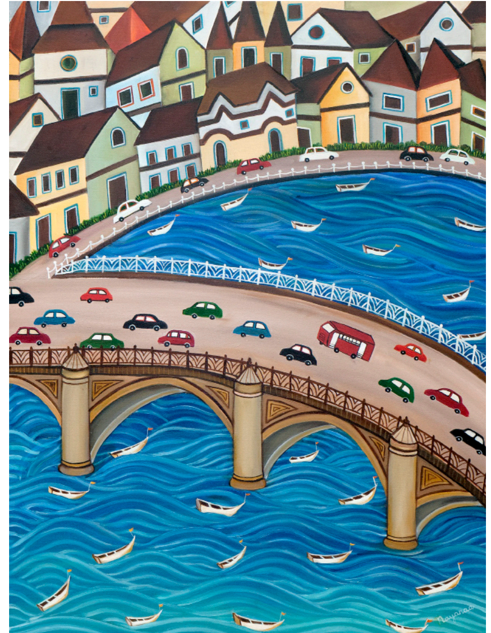
The Sealink | 40"x 30" | Oil on Canvas