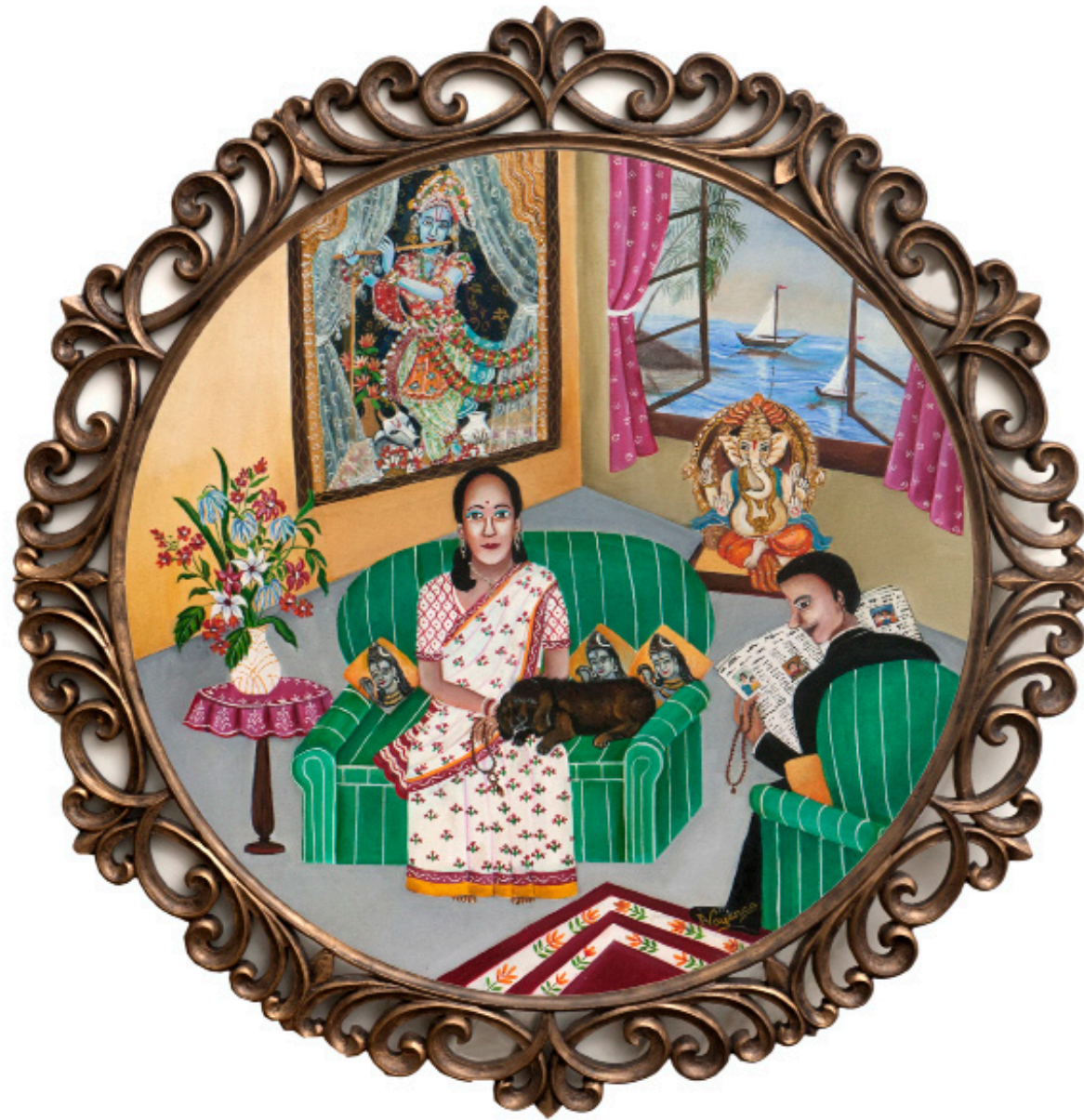
Faith | Dia 30" | Oil on Canvas

Each painting has the potential for several meanings; one revealed by the presence of colours juxtaposed carefully to form a harmonious whole, one revealed by the intricate patterns and details, and one revealed by the underlying content and narration. Thus, what appears to be a choice of method (a technique involving four layers of colour) proves to be the seeds, sun, and water of a highly complex organism of construction.