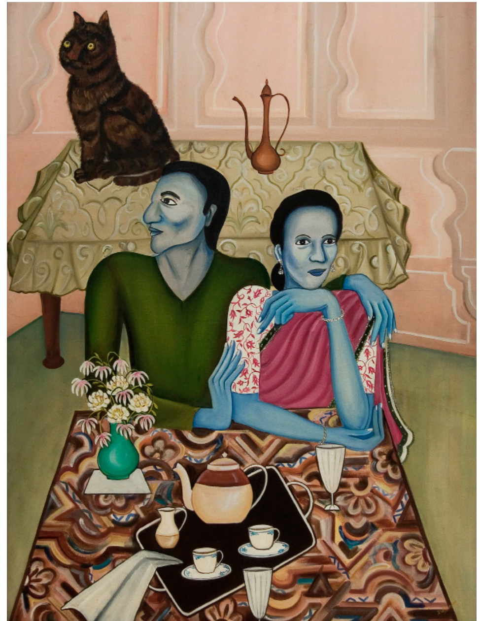
Proximity | 48"x 36" | Oil on Canvas