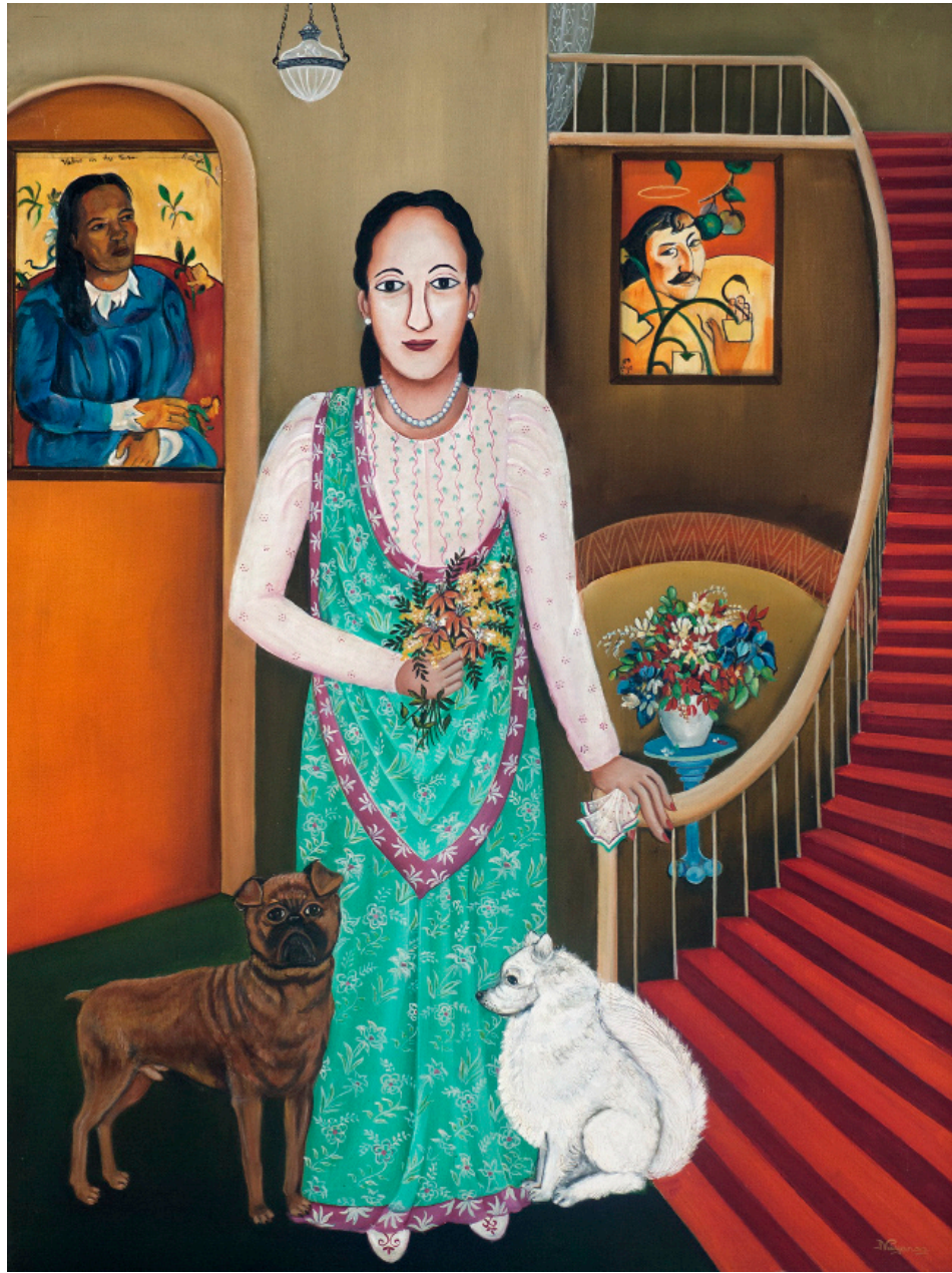
The Staircase | 48"x 36" | Oil on Canvas