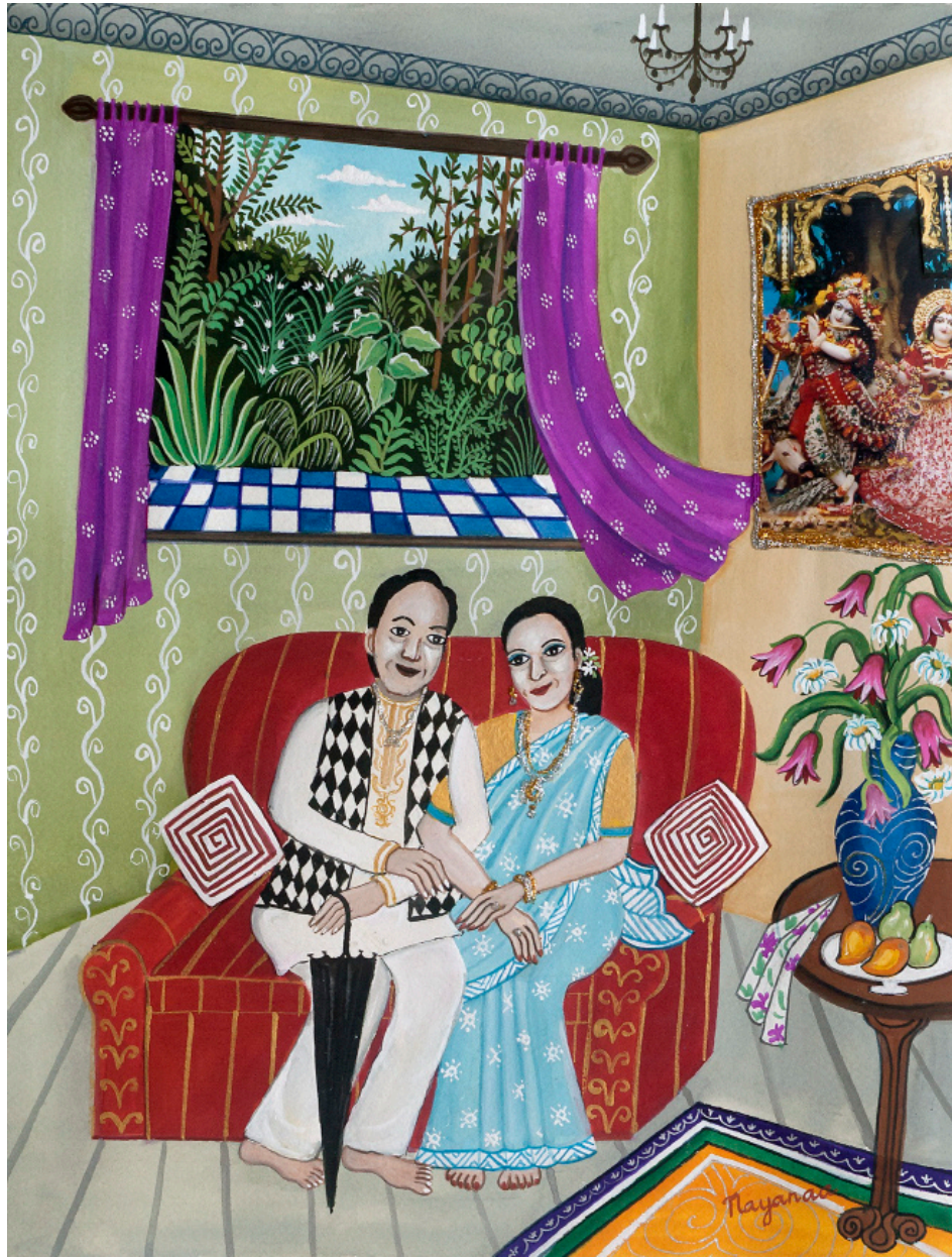
Loving and Caring | 15"x 11.5" | Mixed Media on Paper