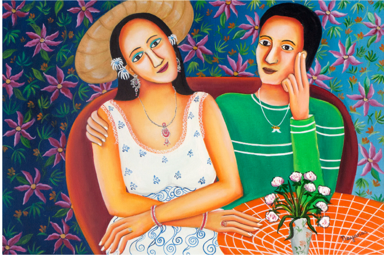
Mamma Mia | 24"x 36" | Oil on Canvas