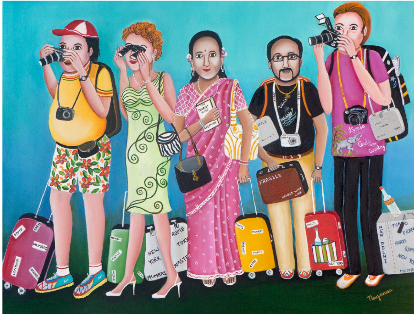
The Tourists | 30"x 40" | Oil on Canvas