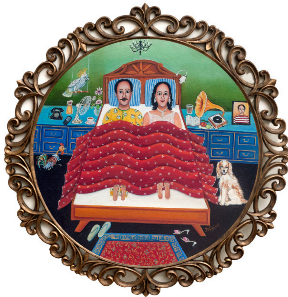
The Red Quilt | Dia 30" | Oil on Canvas