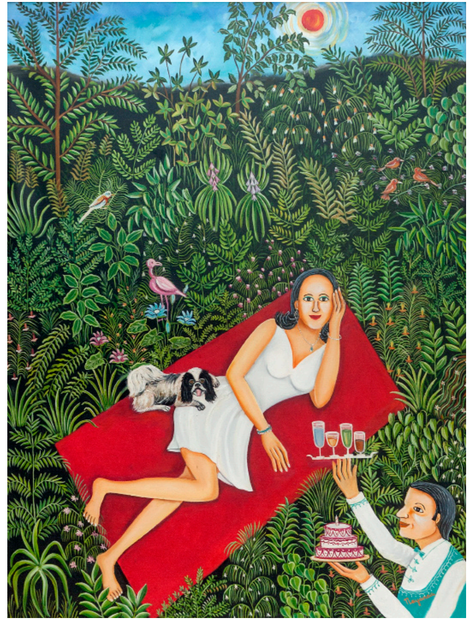
Spoilt for Choice | 48"x 36" | Oil on Canvas