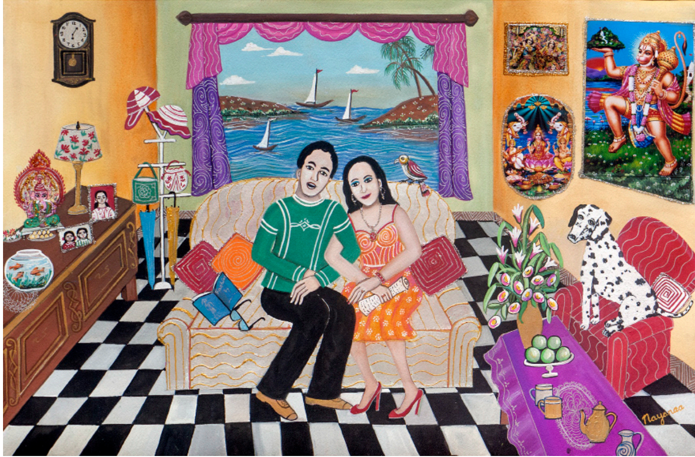
Twosome | 15"x 22.5" | Mixed Media on Paper