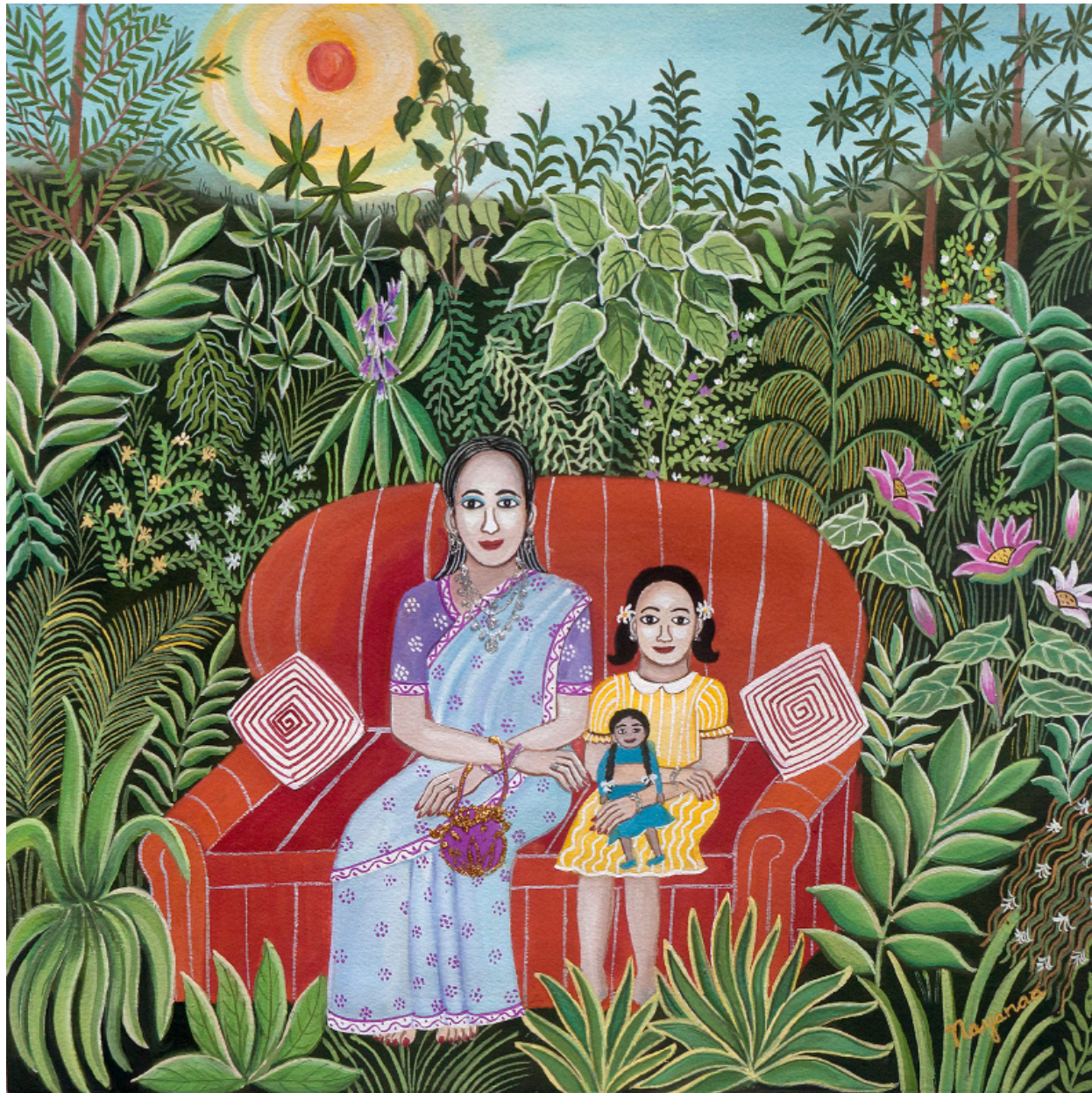
Serenity | 15"x 15" | Oil on Canvas