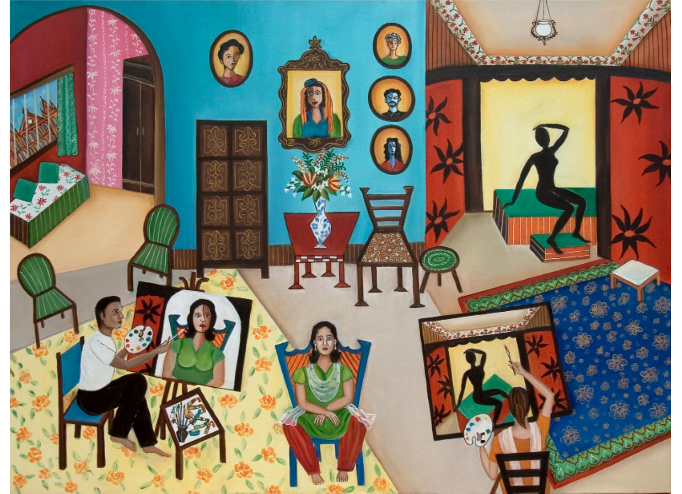
The Artist Couple | 36"x 48" | Oil on Canvas