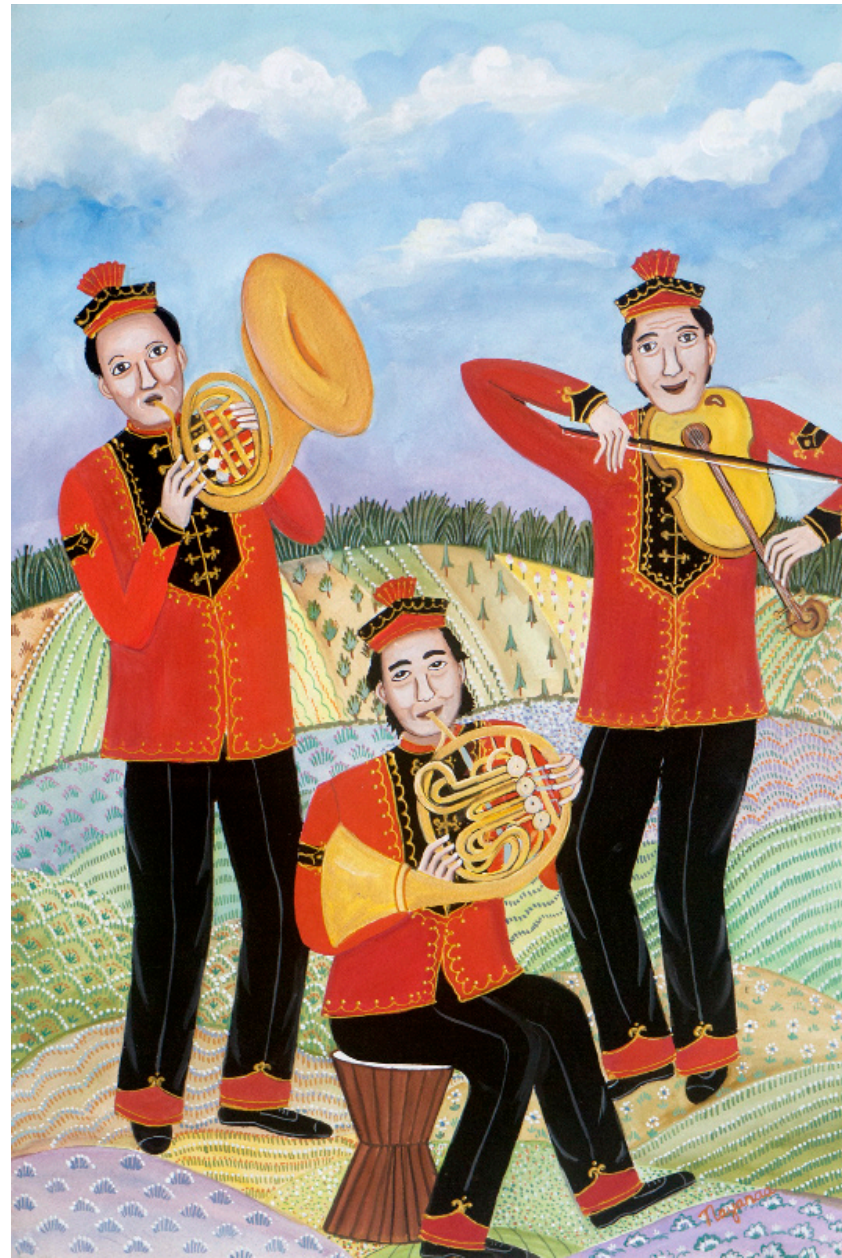
The Bandmasters | 22.5"x 15" | Mixed Media on Paper