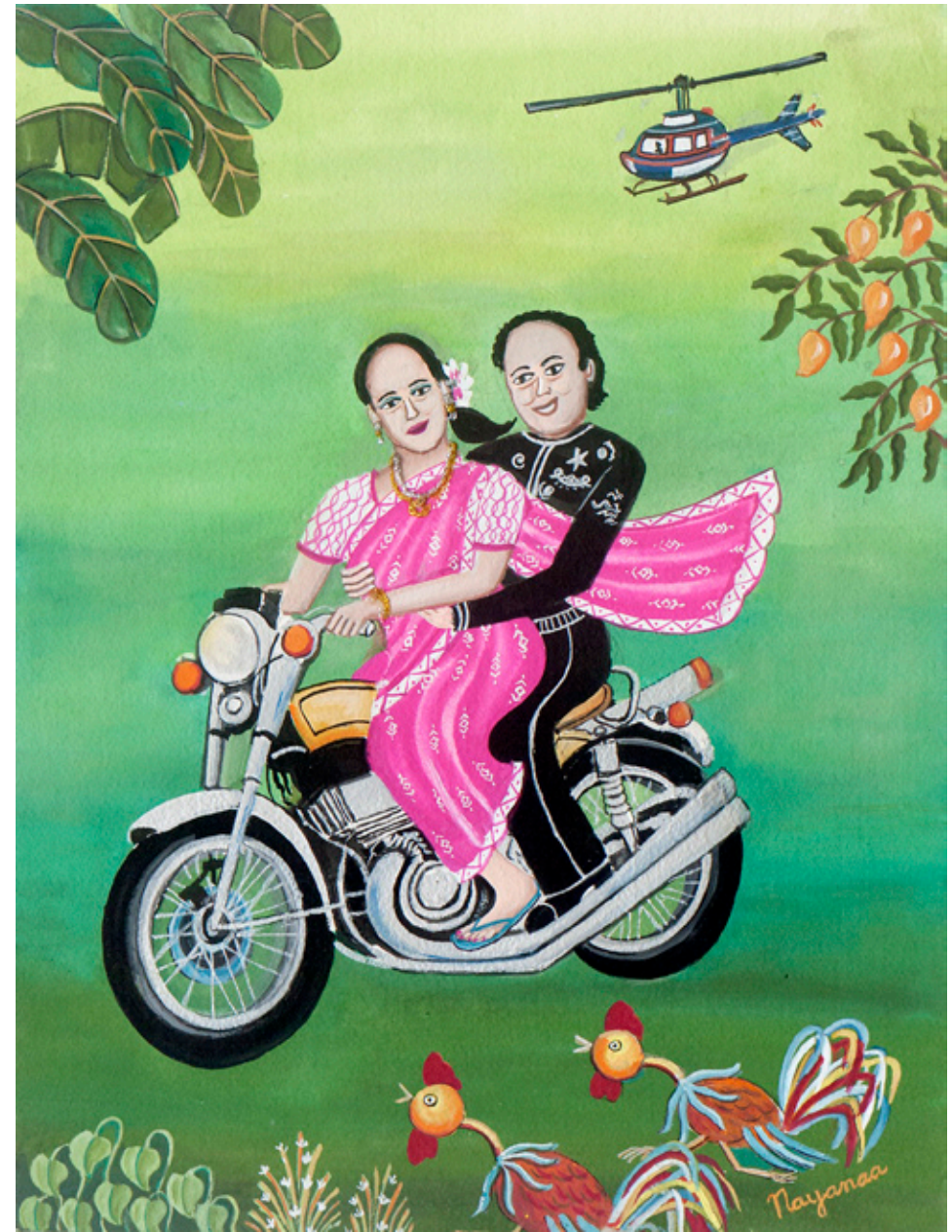
The Race | 15"x 11.5" | Mixed Media on Paper