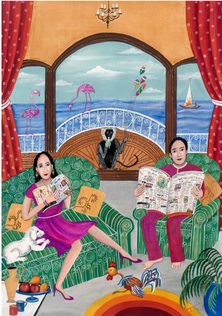
Enriching Ourselves | 25"x 17.5" | Mixed Media on Paper