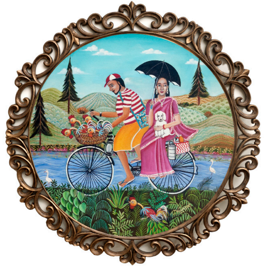
Our Weekly Outing | Dia 24" | Oil on Canvas