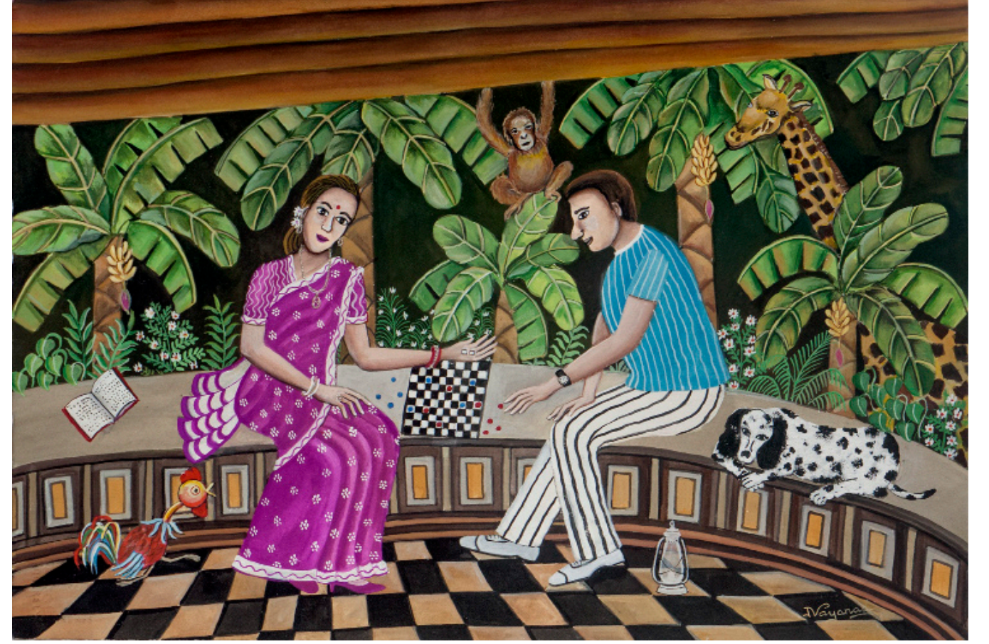
Playing Chess | 15"x 22" | Mixed Media on Paper