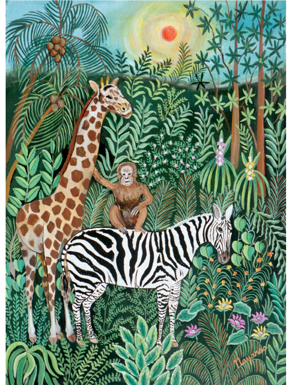
Jungle Mein Mangal | 15"x 11" | Mixed Media on Paper