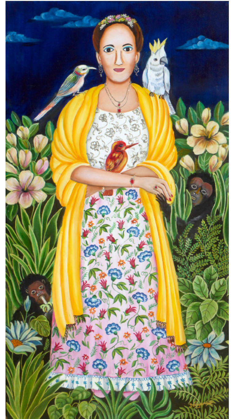
My Friends | 40"x 20" | Oil on Canvas