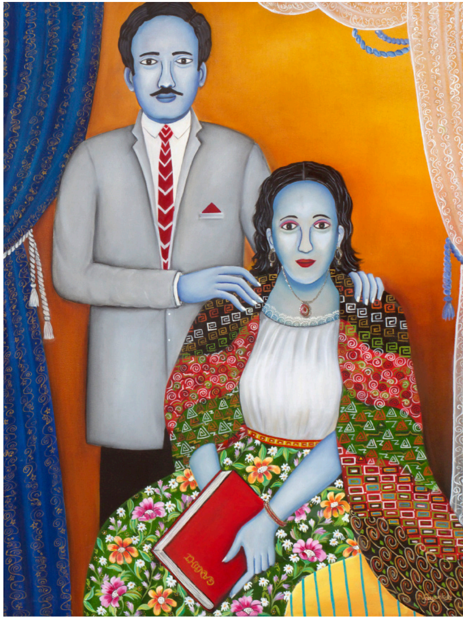
Passage of Time | 48"x 36" | Oil on Canvas